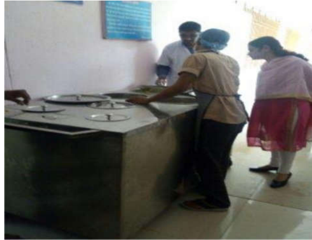
Picture 3: Renovation for better dietary services at Indra Gandhi District Hospital, Korba (Chhattisgarh)