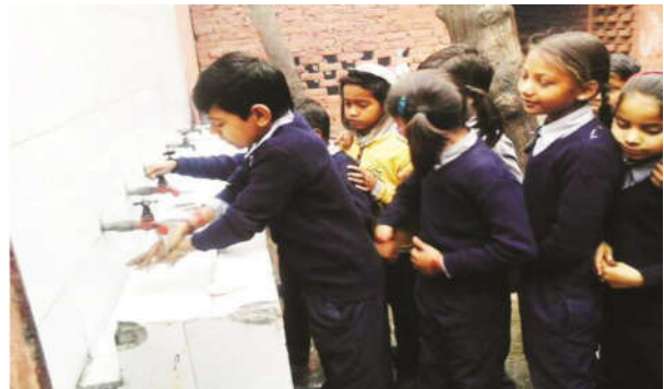
Picture 5: Hand Washing training for school children, District Hospital Panchkula, Haryana