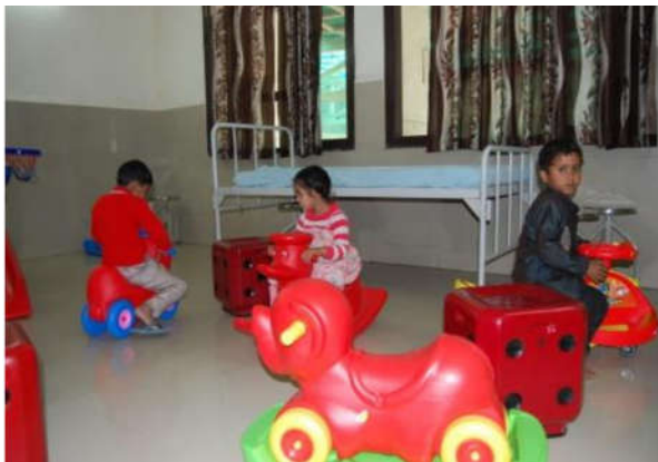
Picture 2: Children's play area in paediatrics ward at Civil Hospital, Amritsar