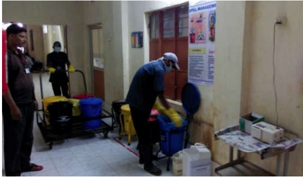
Picture 7: Scientific Management of Biomedical Waste at DHH Koraput (Odisha)